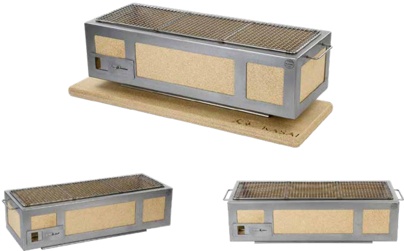
LONG KASAI® KONRO GRILL WITH STAINLESS STEEL FRAME

Nothing tastes quite like charcoal grilled chicken skewers or yakitori. Now you can make delicious yakitori and other grilled dishes on your patio tabletop with this convenient Japanese style charcoal grill. With decent quality lump charcoal or Binchotan a Konro produces a very hot source of heat (750°C). The compact size and shape and the firebrick/ceramic construction makes these grills perfect for cooking skewers of meat or sliced vegetables. The food is inches away from the charcoal and the juice that drips down is instantly evaporated into a smoky cloud of deliciousness that infuses with the food on the grill. The hot temperature is also perfect for creating crisp caramelised skins on chicken and other meats. Makes food taste great!